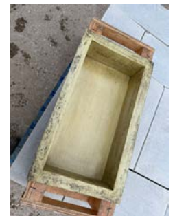
Concrete block with branding