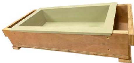
Padstone Polyurethane Mould in Timber Support Frame Concrete block with branding for Willowcrete

440x215x100mm PU Liner only mould (List Price £90.00) 10+ @ £75.00 each & Timber Frame £25.00